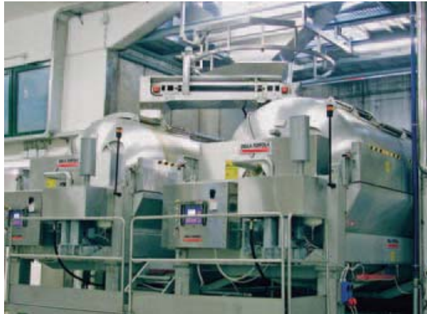
Della Toffola central membrane press technology.

Grape receival bins and layouts can provide fast intake of fruit and destemmer/crushers exist which are capable of processing in excess of 100 tonnes per hour. A bottleneck in current Australian winery process flow can be caused by side