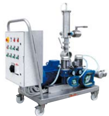
Static format pictured