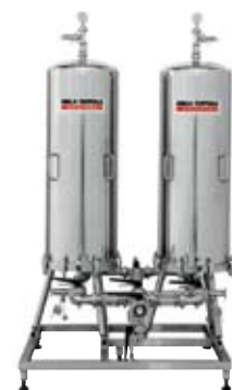
Housing for microfiltration pictured