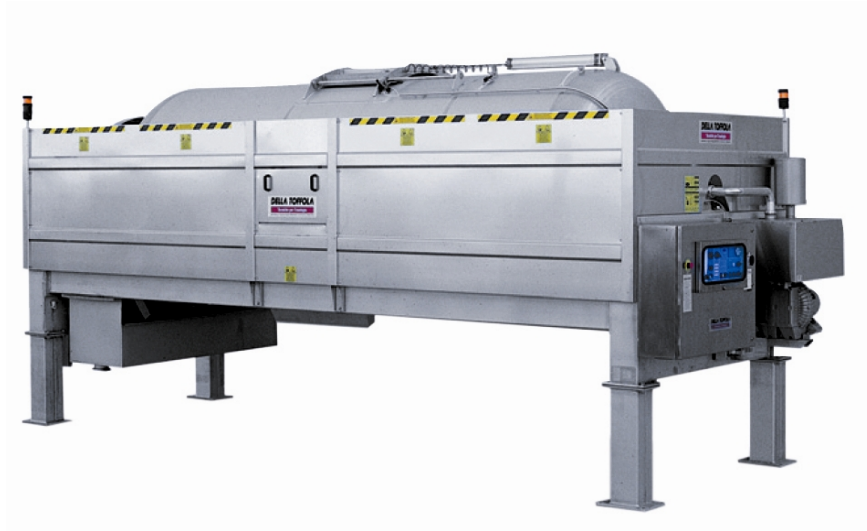
The Della Toffola Central Membrane Air Bag Press